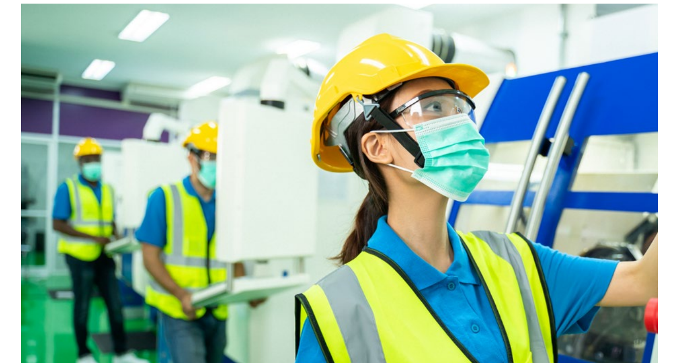
AirLogic™ monitors airborne emission levels from manufacturing facilities.