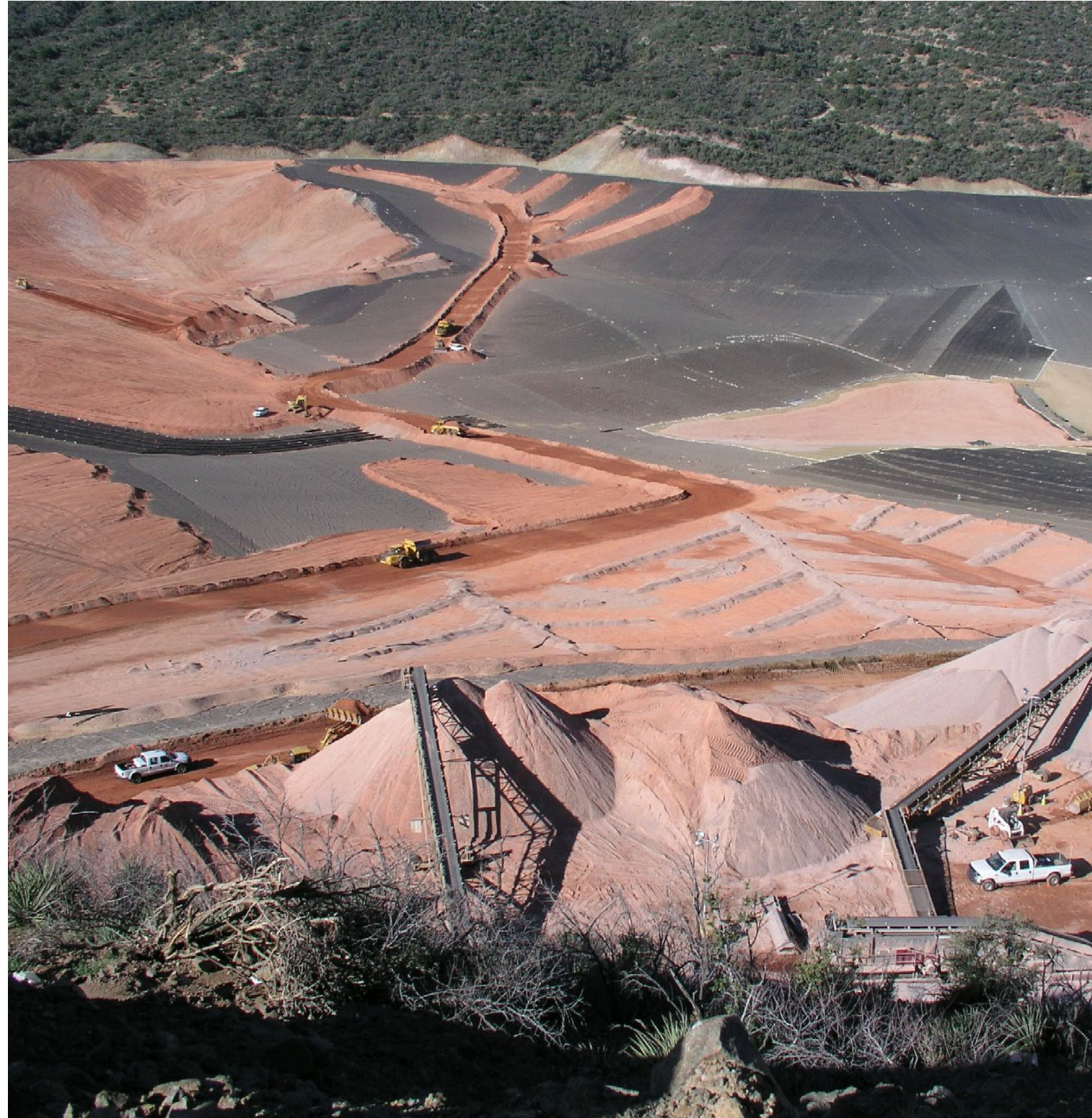
AirLogic™ can track airborne dust from mining operations.